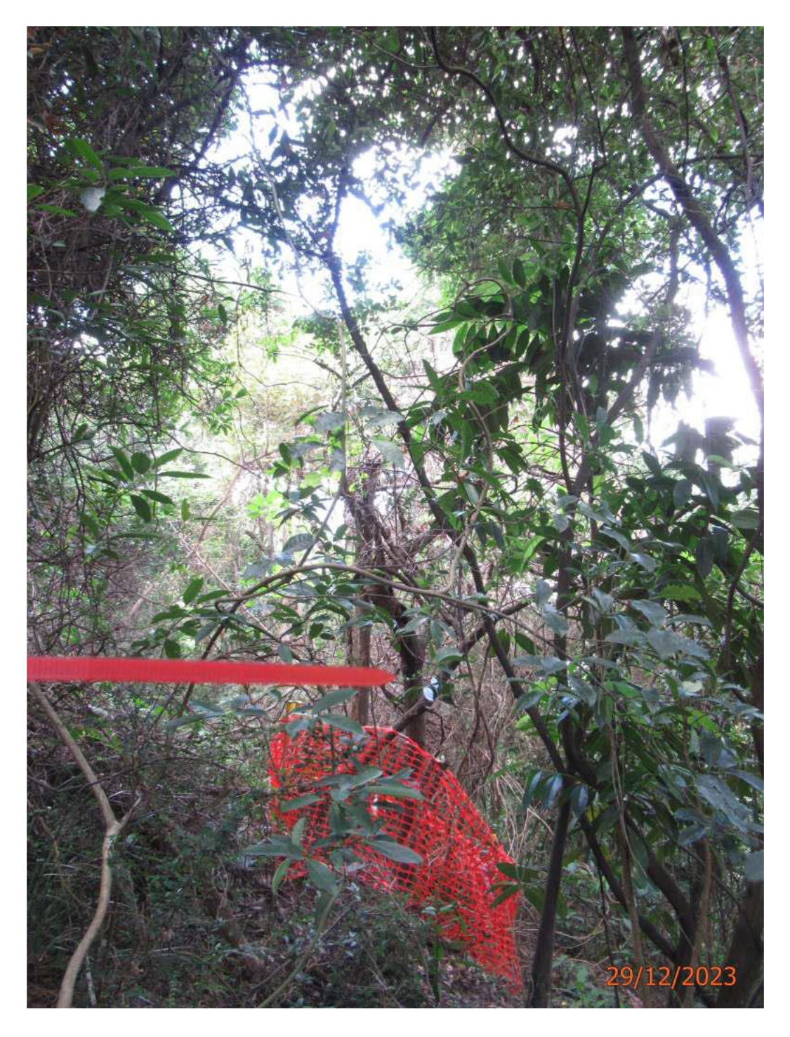
Photo 1 – Tree protection zone for preserved plant species of conservation importance \,